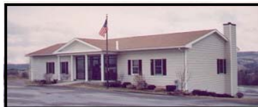
Board of Assessment Review 4 th Tuesday of May